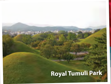
Royal Tumuli Park