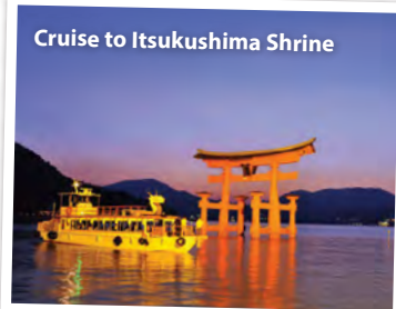
Cruise to Itsukushima Shrine