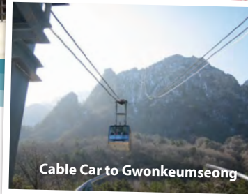
Cable Car to Gwonkeumseong

Visit Insadong, a street full of traditional Korean antiques and tea houses. Continue to Cheonggyecheon Stream and admire its unique beauty, before visiting Myeongdong , one of Seoul's main commercial districts. Then visit a Korean Ginseng Centre to learn about Ginseng, which has existed for thousands of years to improve people's overall health. Later, experience the city's best night view at Namsan tower .