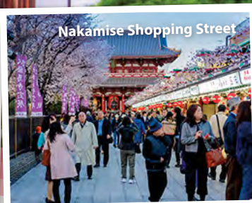
Nakamise Shopping Street