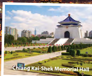
Chiang Kai-Shek Memorial Hall