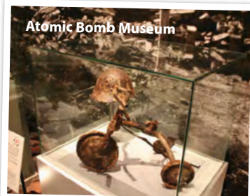
Atomic Bomb Museum