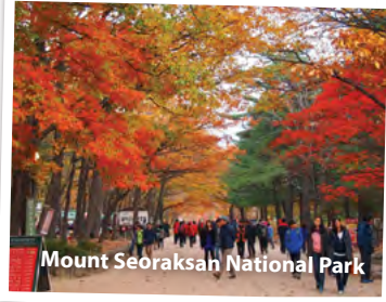
Mount Seoraksan National Park

Immerse yourself on an incredible journey covering two fascinating countries, Japan and South Korea. Discover South Korea's capital city, Seoul. Seoul is Korea's financial, political, commercial and cultural centre with over 600 years of history. Travellers can explore the many archaeological sites and temples before enjoying the beautiful natural landscapes this country has to offer.