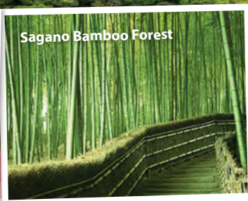
Sagano Bamboo Forest