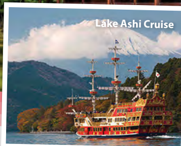
Lake Ashi Cruise