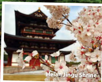
Heian Jingu Shrine